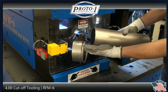
4.00 Cut-off Tooling | RFM-6