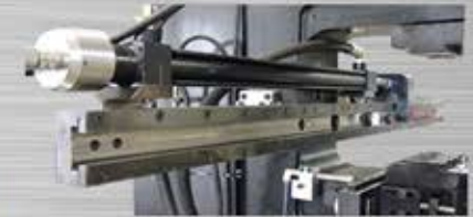
Closeup of die plates and shuttle assembly